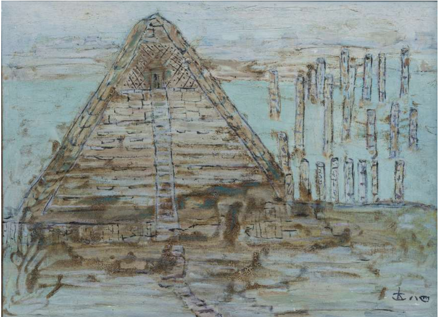
Yucatan II oil on canvas 1984 59 x 82 cm 66 x 88 cm (with frame)